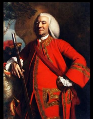
Colonel Jacob Fowle Private Collection ex Corcoran Gallery, Wash DC / Christie's 2011